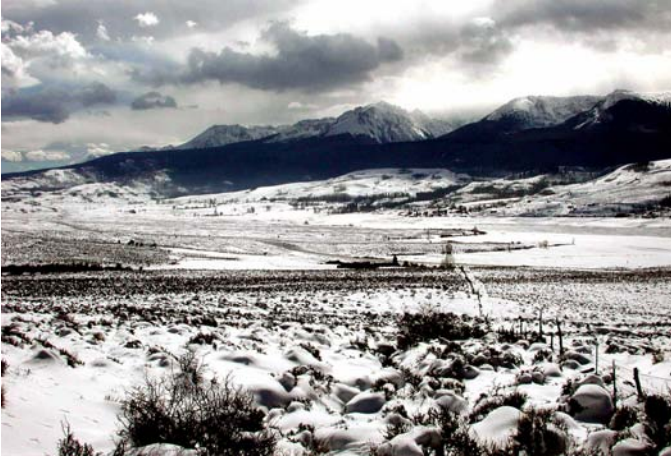
Winter photo of CDLT's Cow Camp easement located near Green Mountain Reservoir.